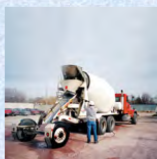
Cleaning a cement truck dump area with convenience of using hydraulic power on that vehicle.