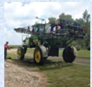
Rinsing an agricultural spraying vehicle with after a day of use in the fields.

Index Petrol & Diesel Direct Drive Gear Box Belt Drive Diesel Spec Sheets Electric Cold Spec Sheets Parts Hot Water Spec Sheets Service Parts Jettors Harpen Sweepers Vacuum Cleaners