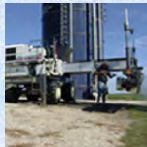
Washing a concrete laser screed with a hydraulic pressure washer connected to the equipment it is cleaning